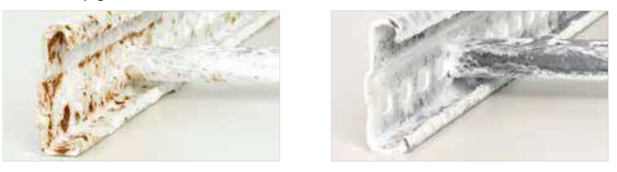
Z4 – 1050 h