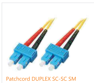
Patchcord DUPLEX SC-SC SM