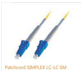
Patchcord SIMPLEX LC-LC SM