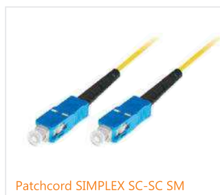
Patchcord SIMPLEX SC-SC SM