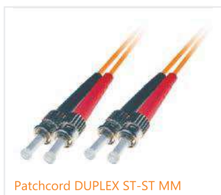
Patchcord DUPLEX ST-ST MM