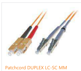
Patchcord DUPLEX LC-SC MM