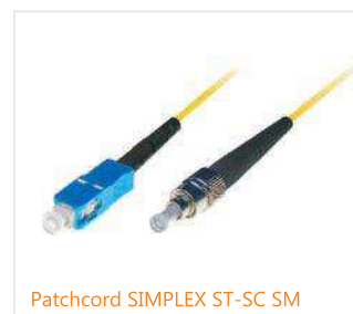
Patchcord SIMPLEX ST-SC SM