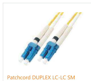
Patchcord DUPLEX LC-LC SM