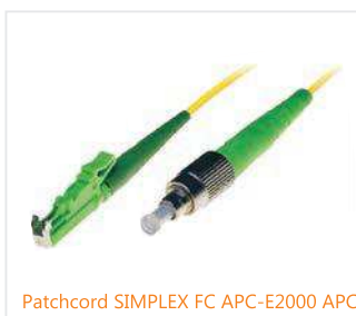
Patchcord SIMPLEX FC APC-E2000 APC