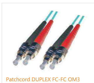
Patchcord DUPLEX FC-FC OM3