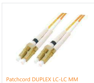
Patchcord DUPLEX LC-LC MM