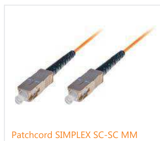
Patchcord SIMPLEX SC-SC MM