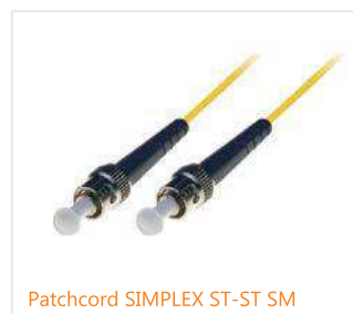
Patchcord SIMPLEX ST-ST SM