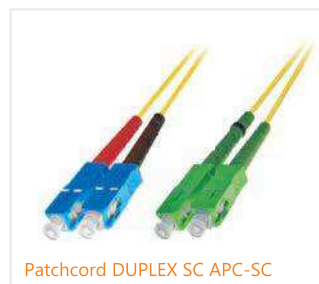
Patchcord DUPLEX SC APC-SC