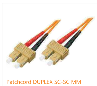
Patchcord DUPLEX SC-SC MM