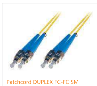
Patchcord DUPLEX FC-FC SM