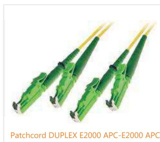
Patchcord DUPLEX E2000 APC-E2000 APC