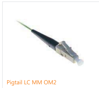
Pigtail LC MM OM2