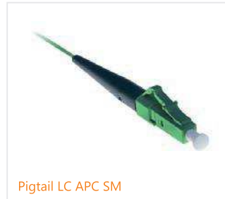
Pigtail LC APC SM