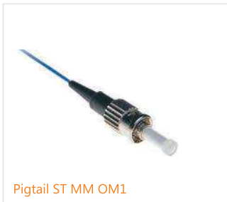
Pigtail ST MM OM1