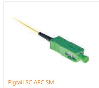
Pigtail SC APC SM