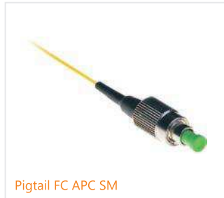
Pigtail FC APC SM