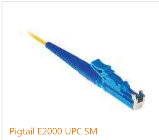
Pigtail E2000 UPC SM