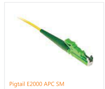
Pigtail E2000 APC SM