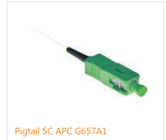
Pigtail SC APC G657A1