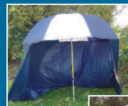
CLY 700 0 10