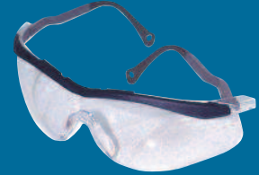
CLY 530 T565BC