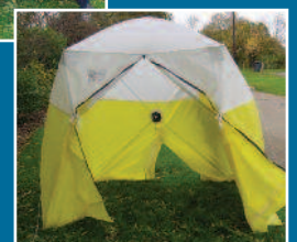
CLY 700 1 02