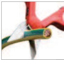
To cut Cu/Al cables up to 50 mm 2