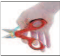
Special blade design: to cut and strip cables