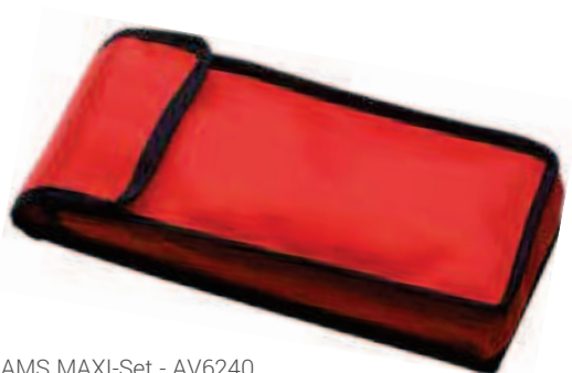
AMS MAXI-Set - AV6240