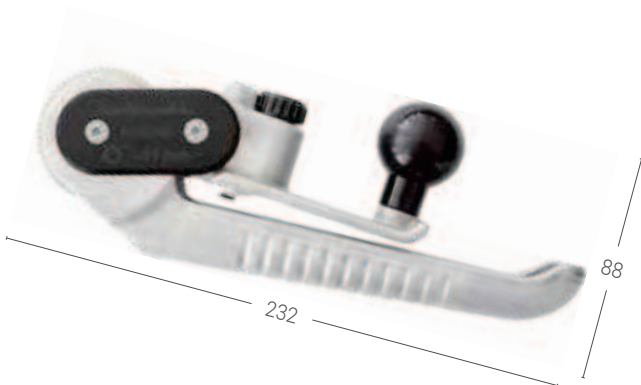
Universal cable stripper AMS MAXI - AV6240