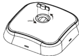
Fig.1 Replace the lens: insert the tool into the two holes of the lens and rotate it anticlockwise direction to open.