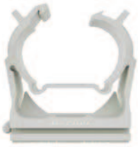
Locking clip SCN