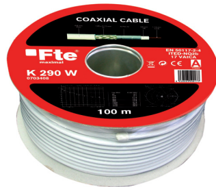
K 290 W reel