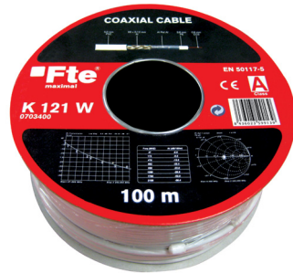
K 121 W